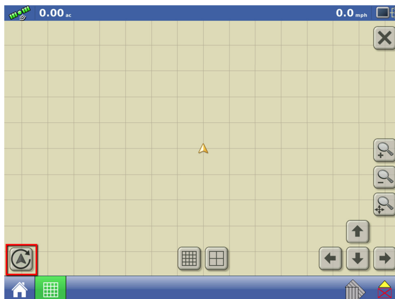
Figure 2 - Press center of map screen and heading change button will appear

When Heading Detection is disabled, the GPS heading will always be considered as forward.