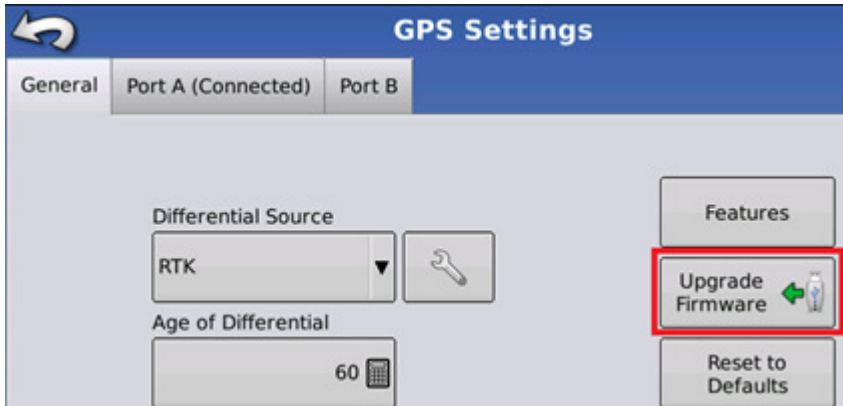
Figure 1: Update Firmware

Note: Do not disconnect or cycle power during the update. This could cause unintended consequences. Contact Technical Support if this happens and the unit is unresponsive.